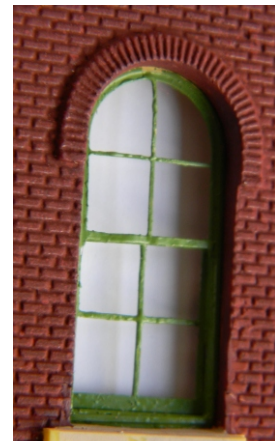
Using BW3 in a building