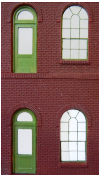
Using BFW21 with the lower panes open.

The vertical sash windows need to be assembled by folding up the lower sash frame and fitting it behind the main window etching. Both these illustrations have been fitted to a large factory made from DPM modules - a plastic building product from Bachmann. We have changed the plastic windows but not the doors to etched ones as illustrated by the third photograph - this uses BFW12_4 windows.