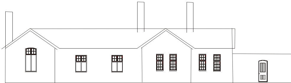
Outline of Saxby MR Station rear

The first of the two illustrations show an inward tilting lower section finished as open, while above it is a closed version.